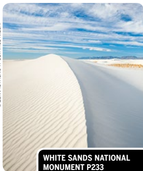
WHITE SANDS NATIONAL MONUMENT P233