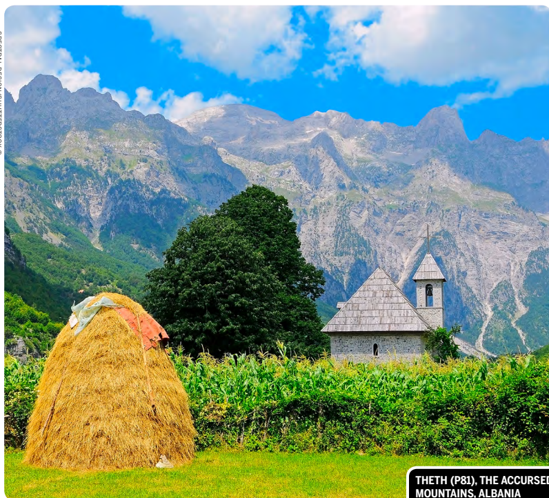
THETH (P81), THE ACCURSED MOUNTAINS, ALBANIA