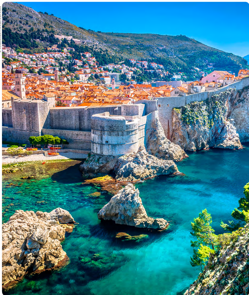
Top: Old Town city walls (p197), Dubrovnik, Croatia, Bottom: Mosaic, National History Museum (p53), Tirana, Albania