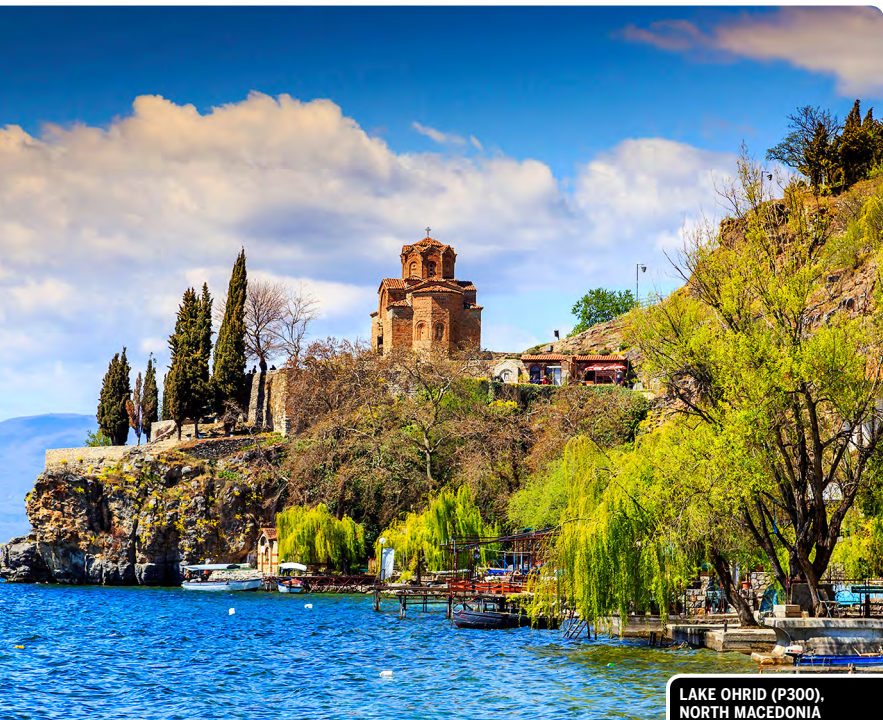
LAKE OHRID (P300). NORTH MACEDONIA