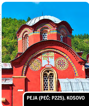
PEJA (PEĆ; P225), KOSOVO