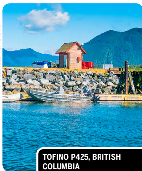
TOFINO P425, BRITISH COLUMBIA