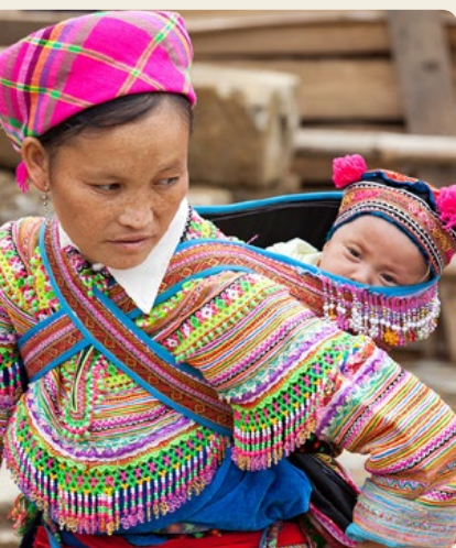
GIL K. SHUTTERSTOCK ©