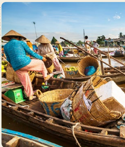
Top: Si Phan Don (p380), Laos Bottom: Floating market, Can Tho (p154), Vietnam