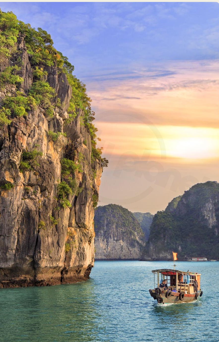
Halong Bay (p71), Vietnam