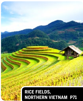
RICE FIELDS, NORTHERN VIETNAM P71