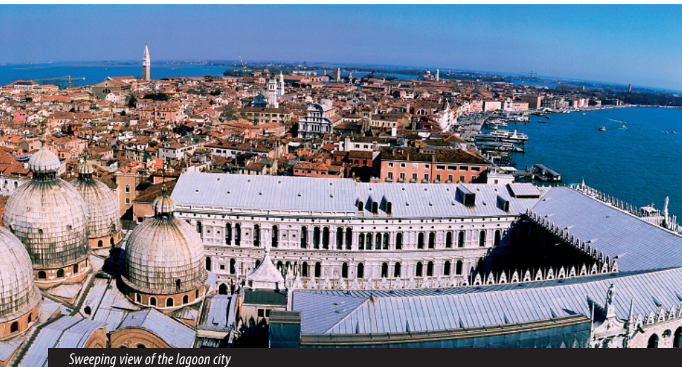
Sweeping view of the lagoon city

The most sensitive local subject is still Mose (Modulo Sperimentale Elettromeccanico), the controversial flood barrier system currently under construction. But the combined effects of industrial pollution and global warming are also taken very seriously in this fragile lagoon ecosystem, and any effort you make to help mitigate the impact of travel – stay longer, eat and drink local specialties, support local artisans, tidy up after yourself – makes you a most welcome guest.