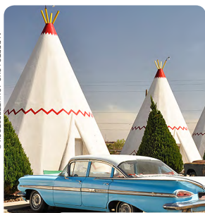
WIGWAM MOTEL, ROUTE 66 P863