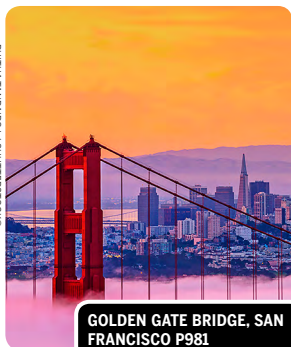
GOLDEN GATE BRIDGE, SAN FRANCISCO P981