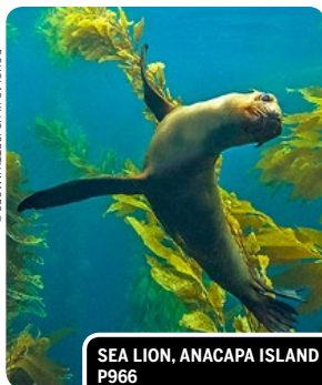
SEA LION, ANACAPA ISLAND P966