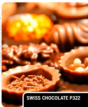
SWISS CHOCOLATE P322