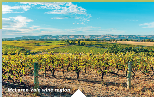
McLaren Vale wine region