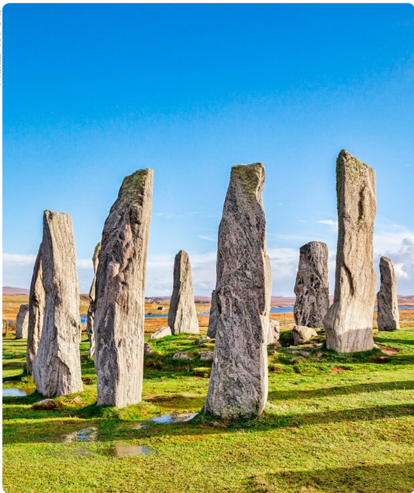
Top: Callanish Standing Stones (p388)