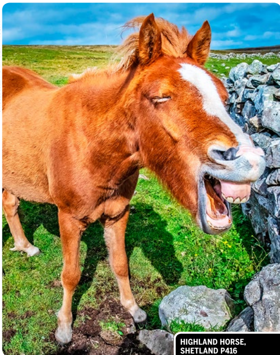
HIGHLAND HORSE, SHETLAND P416