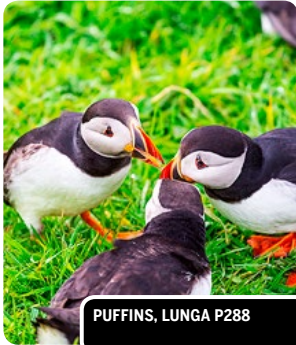
PUFFINS, LUNGA P288