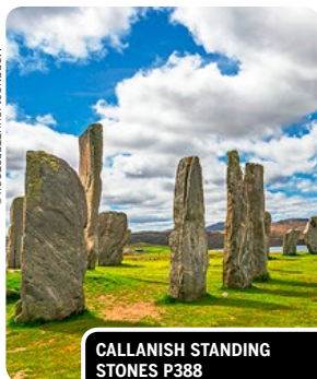
CALLANISH STANDING STONES P388