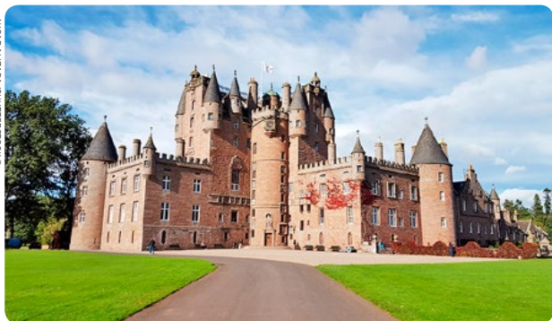
Bottom: Glamis Castle (p219)