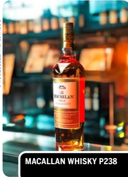
MACALLAN WHISKY P238