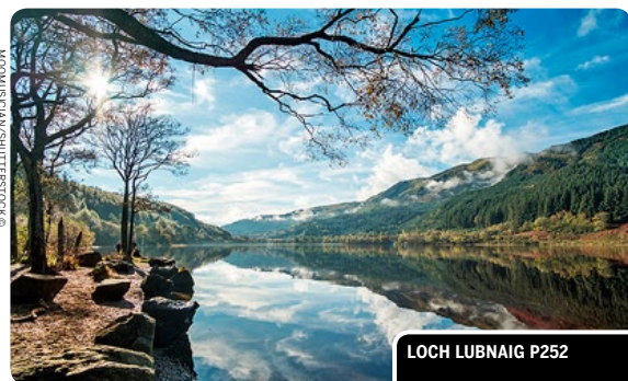
LOCH LUBNAIG P252