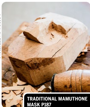
TRADITIONAL MAMUTHONE MASK P187