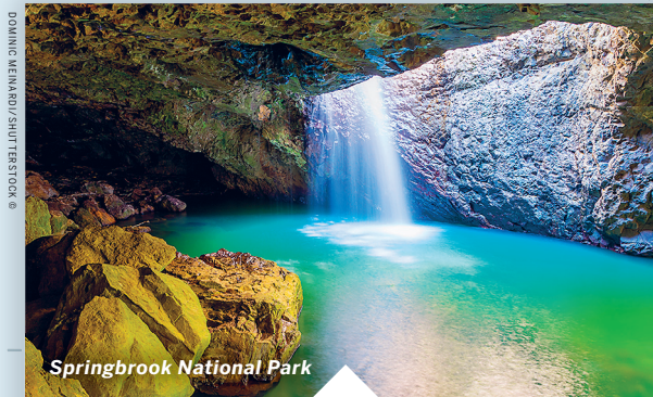
Springbrook National Park