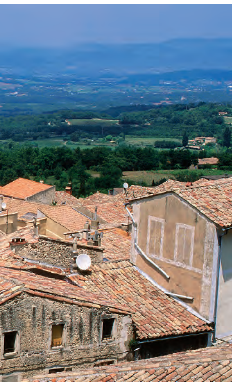
GLEN VON BERNHOF

This classic trio just doesn't lose its edge: Bonnieux (p158) boasts a bread-making museum and cedar forest; Ménerbes (p160) a truffle house and corkscrew museum. For a view of Gordes (p152) tumbling down the hillside, approach it from the south.