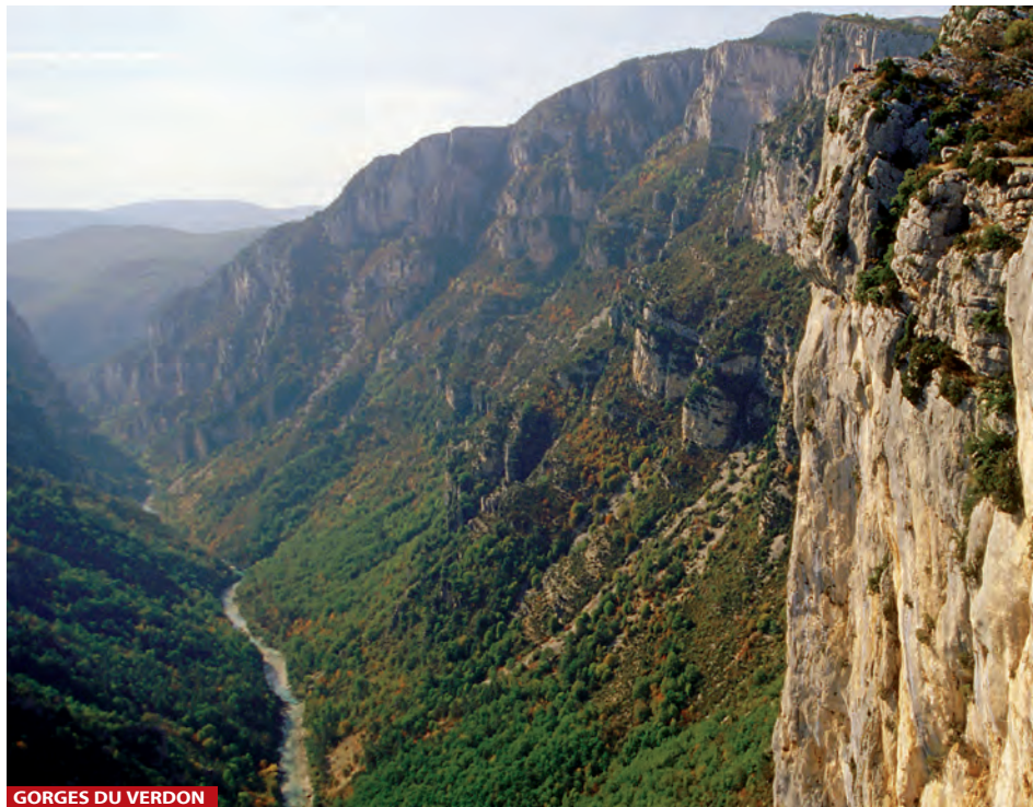
GORGES DU VERDON