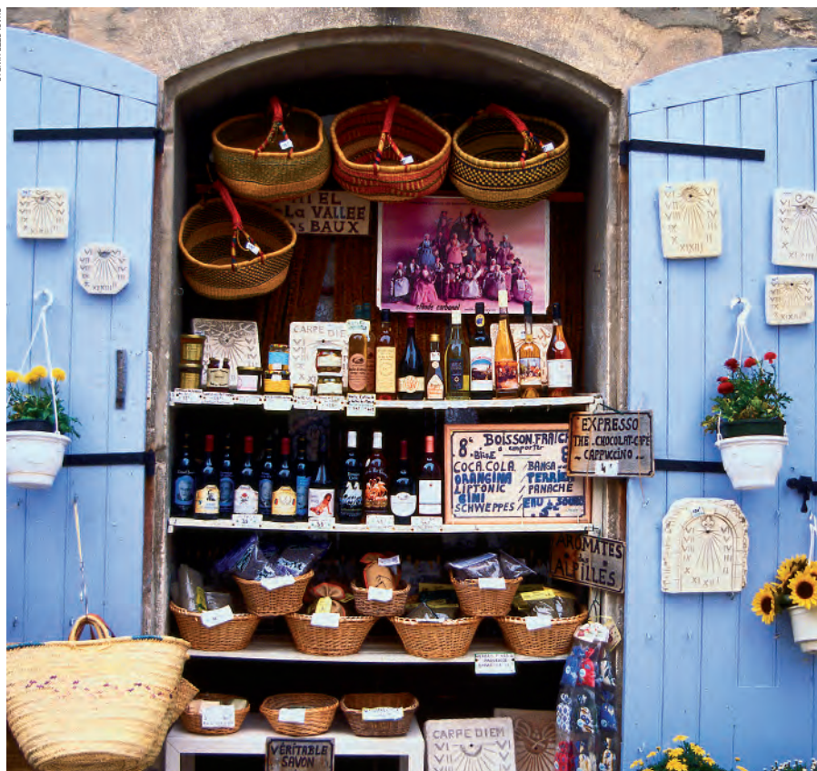
ABOVE Colourful wares in a shopfront in Les Baux de Provence