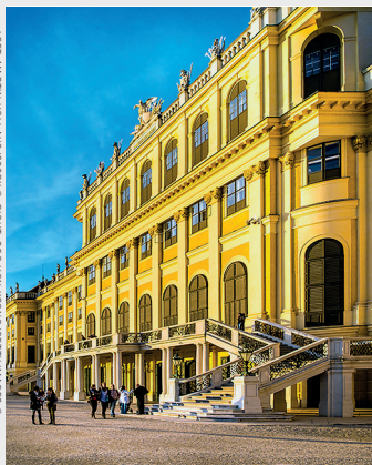
LEFT: MARTIN HOLLAU/SOOPX ©; RIGHT: SOO HON KEONG/GETTY IMAGES ©