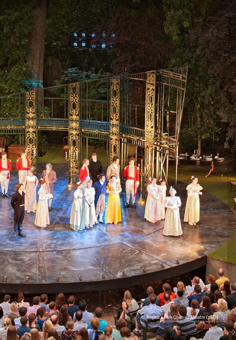
Regent's Park Open-air Theatre (p175)