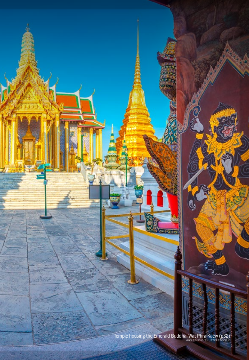
Temple housing the Emerald Buddha, Wat Phra Kaew (p32)