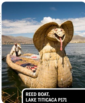
REED BOAT, LAKE TITICACA P171