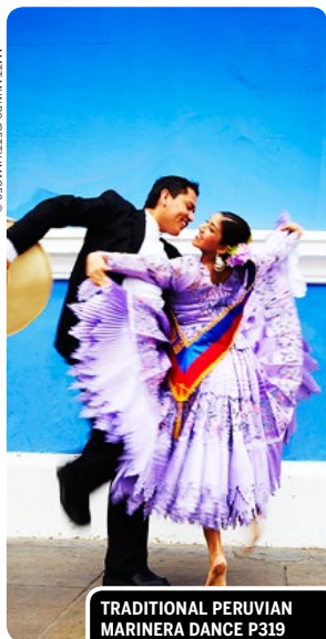
TRADITIONAL PERUVIAN MARINERA DANCE P319