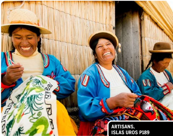
ARTISANS, ISLAS UROS P189