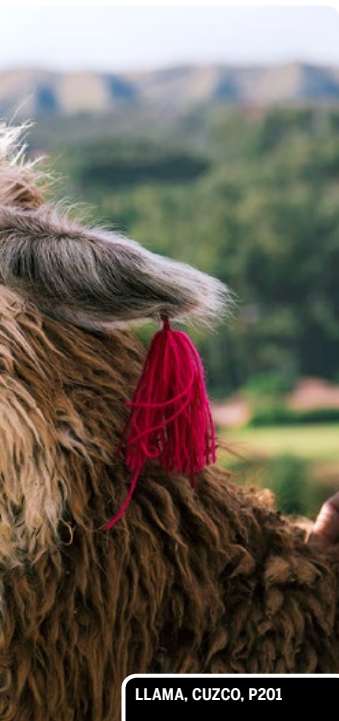
LLAMA, CUZCO, P201