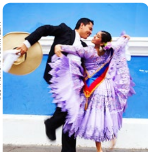
MARINERA DANCERS, TRUJILLO P27