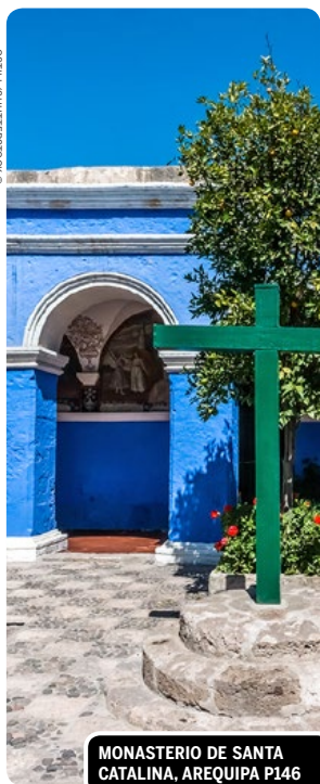
MONASTERIO DE SANTA CATALINA, AREQUIPA P146