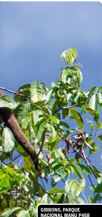
GIBBONS, PARQUE NACIONAL MANU P468