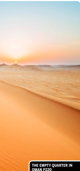
THE EMPTY QUARTER IN OMAN P220