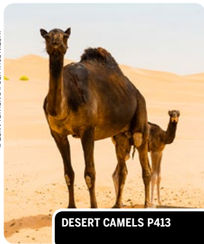
DESERT CAMELS P413