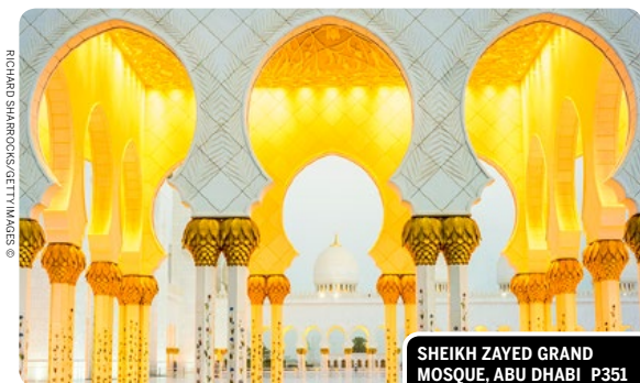
SHEIKH ZAYED GRAND MOSQUE, ABU DHABI P351