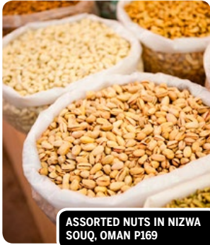
ASSORTED NUTS IN NIZWA SOUQ, OMAN P169