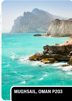
MUGHSAIL, OMAN P203