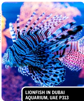
LIONFISH IN DUBAI AQUARIUM, UAE P313