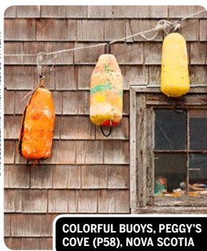
COLORFUL BUOYS, PEGGY'S COVE (P58), NOVA SCOTIA