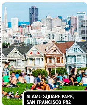
ALAMO SQUARE PARK, SAN FRANCISCO P82