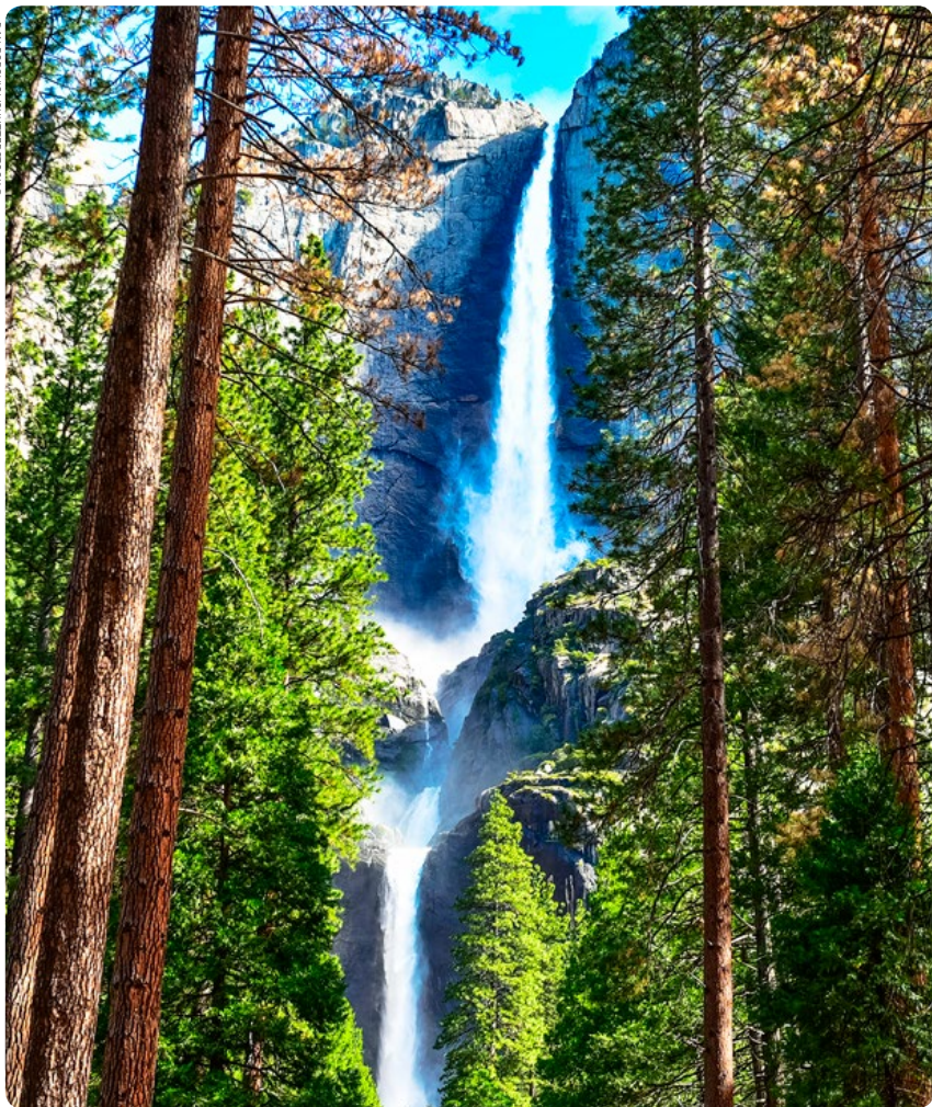
Top: Yosemite Falls (p461), Yosemite National Park