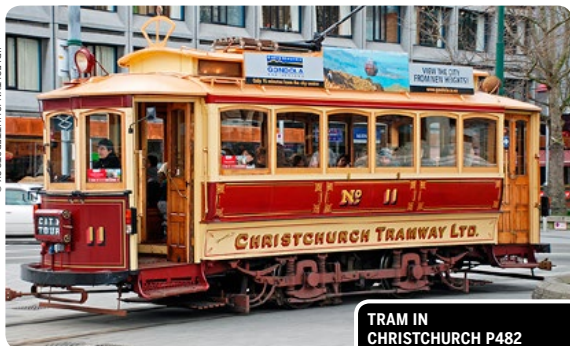
TRAM IN CHRISTCHURCH P482