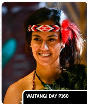
WAITANGI DAY P160