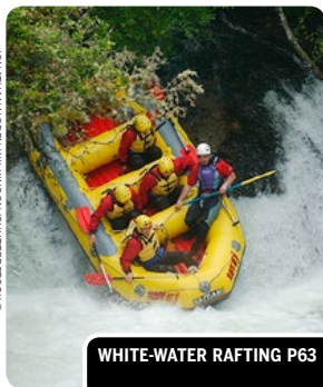
WHITE-WATER RAFTING P63