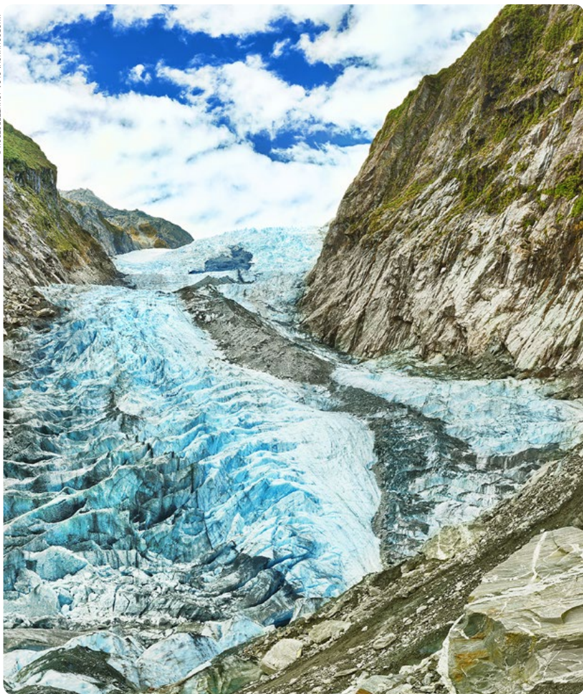
Top: Franz Josef Glacier (p468)