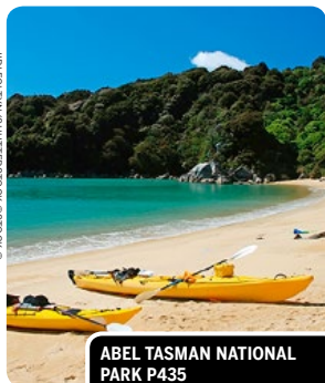
ABEL TASMAN NATIONAL PARK P435