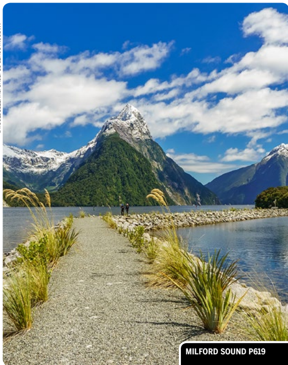
MILFORD SOUND P619