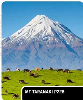
MT TARANAKI P226