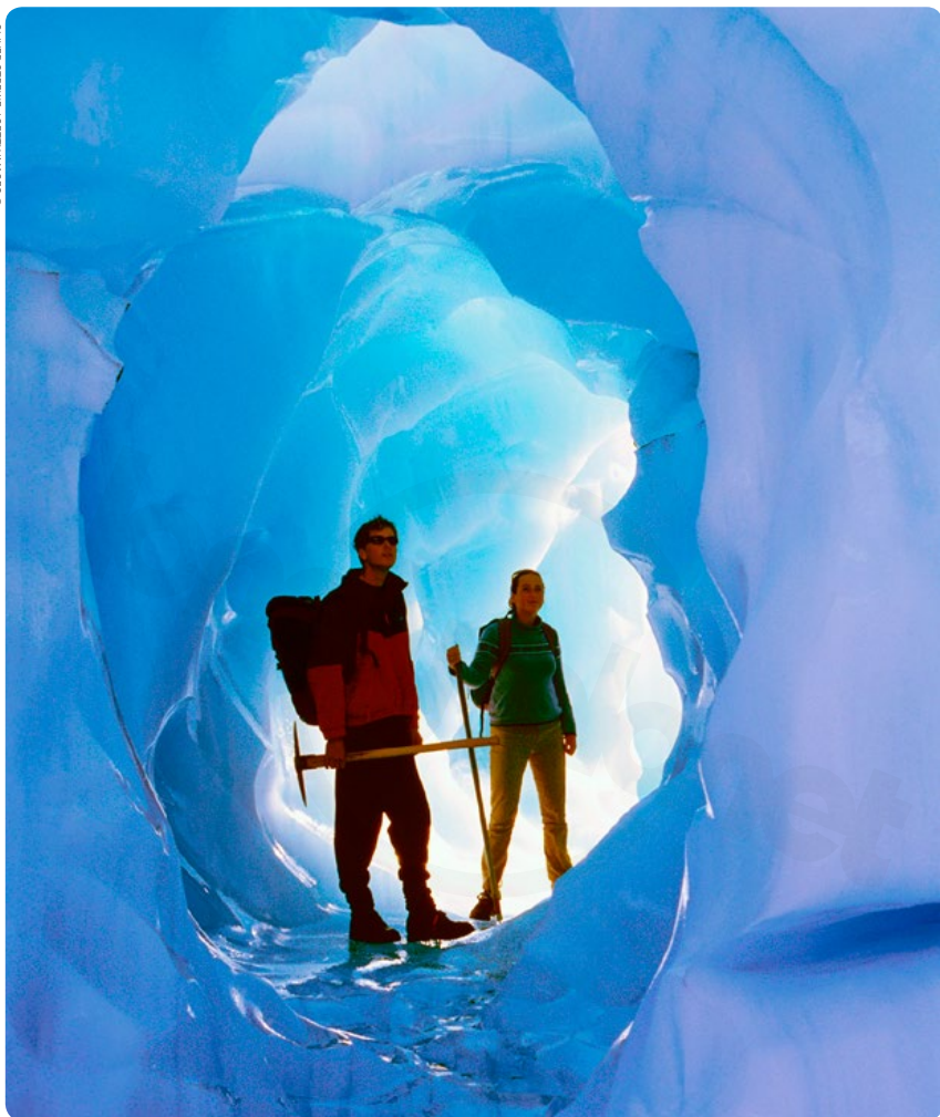
Top: Hikers, Fox Glacier (p451)