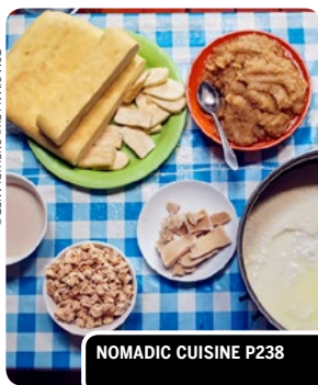
NOMADIC CUISINE P238