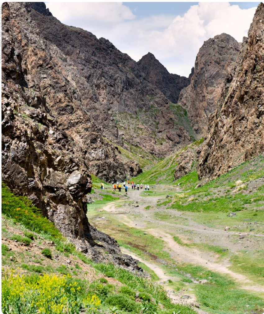
Top: Yolyn Am valley (p180) Bottom: Aglag Khiid (p100)