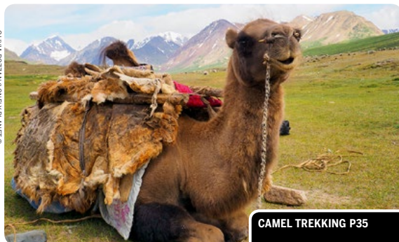
CAMEL TREKKING P35