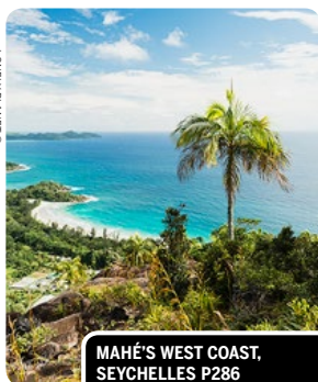
MAHÉ'S WEST COAST, SEYCHELLES P286