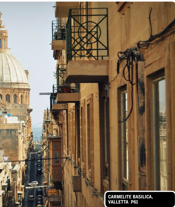
CARMELITE BASILICA, VALLETTA P61