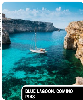
BLUE LAGOON, COMINO P148