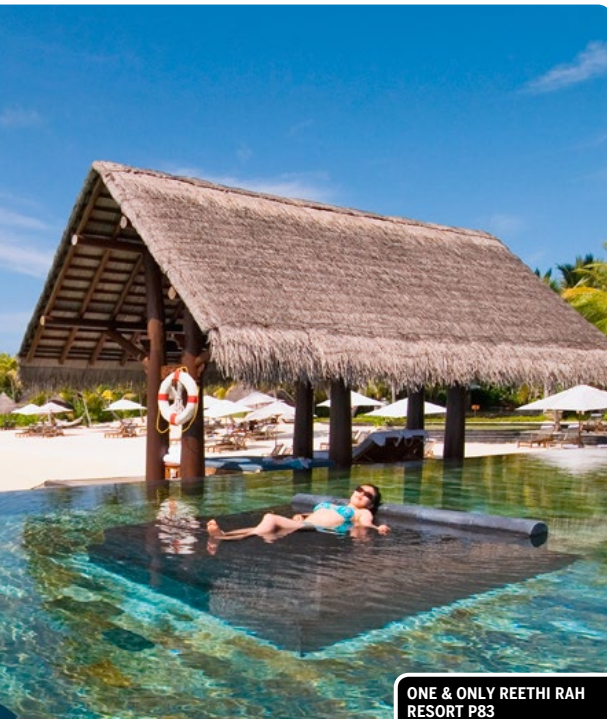
ONE & ONLY REETHI RAH RESORT P83