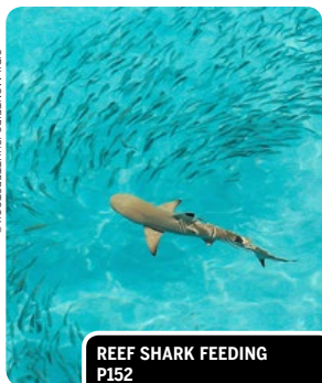
REEF SHARK FEEDING P152