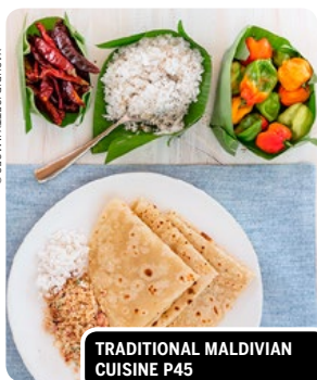
TRADITIONAL MALDIVIAN CUISINE P45