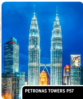
PETRONAS TOWERS P57