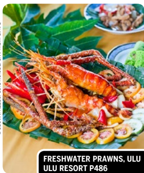
FRESHWATER PRAWNS, ULU ULU RESORT P486