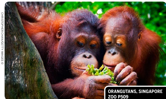
CHRISTOPHER CHANGETTY IMAGES ©