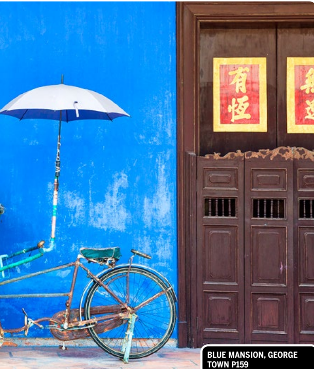
BLUE MANSION, GEORGE TOWN P159