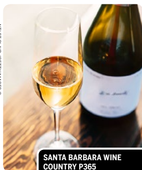
SANTA BARBARA WINE COUNTRY P365