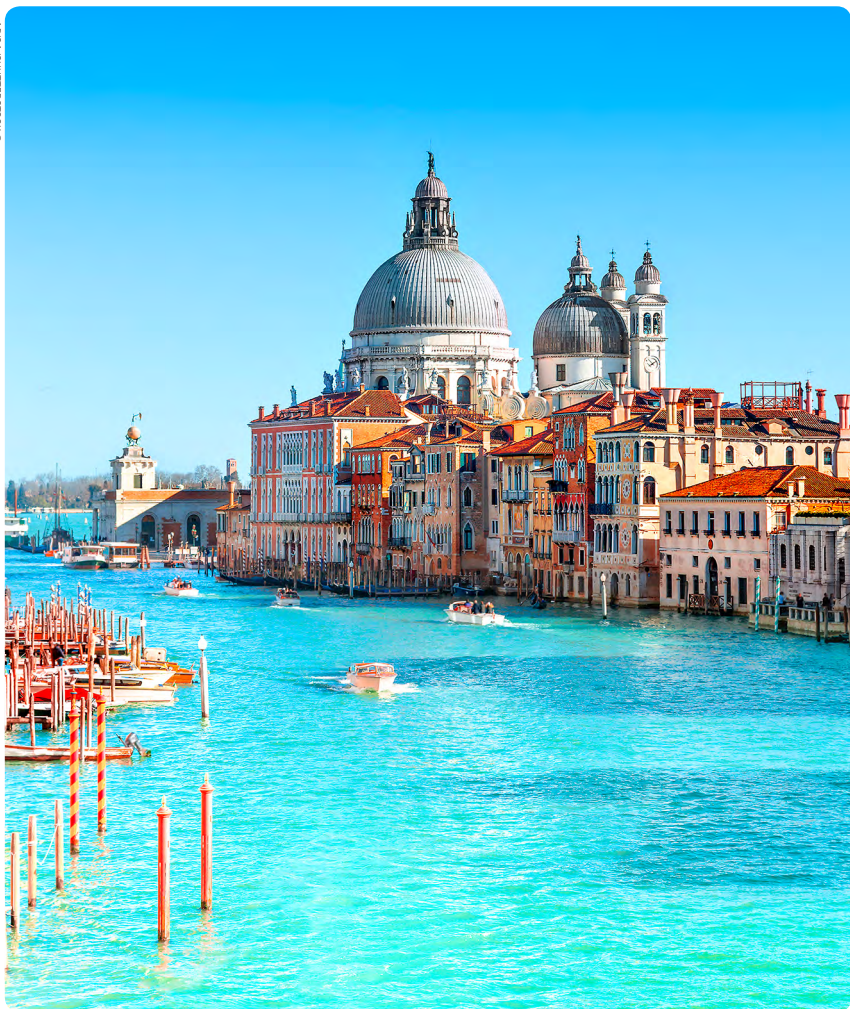
Top: Venice's Grand Canal and the Basilica di Santa Maria delle Salute (p371)