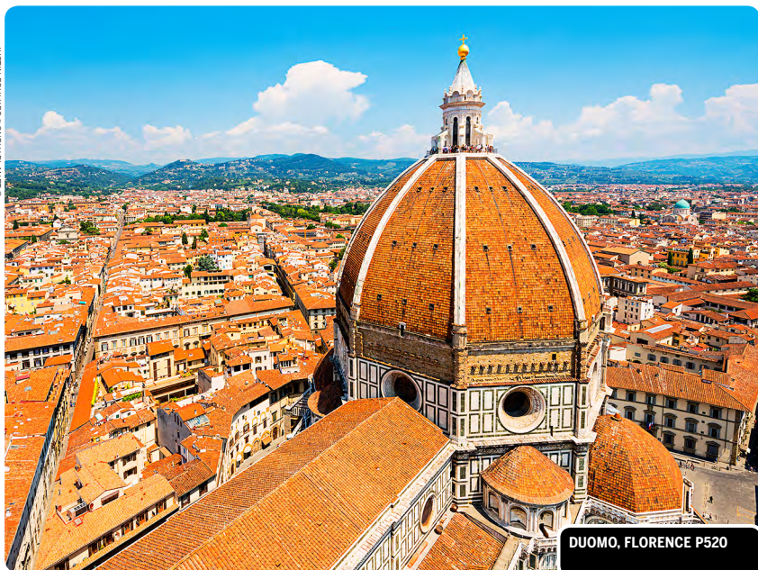
DUOMO, FLORENCE P520