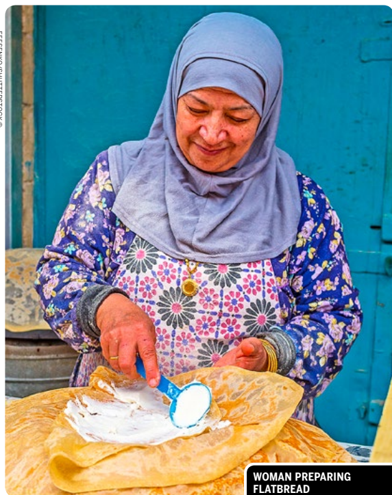
WOMAN PREPARING FLATBREAD