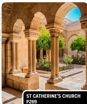
ST CATHERINE'S CHURCH P269