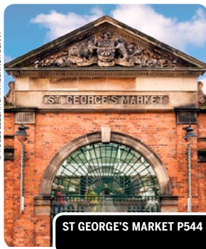
ST GEORGE'S MARKET P544