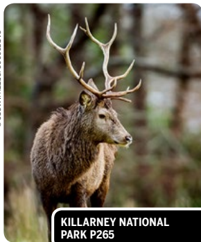
KILLARNEY NATIONAL PARK P265