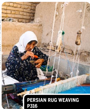
PERSIAN RUG WEAVING P316