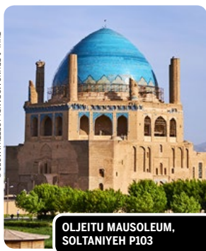
OLJEITU MAUSOLEUM, SOLTANIYEH P103