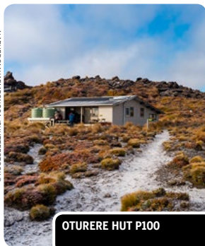
OTURERE HUT P100