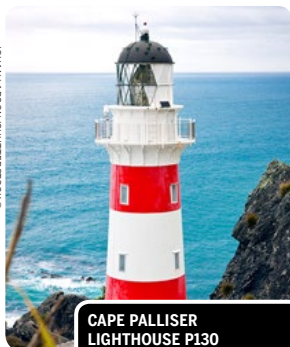
CAPE PALLISER LIGHTHOUSE P130