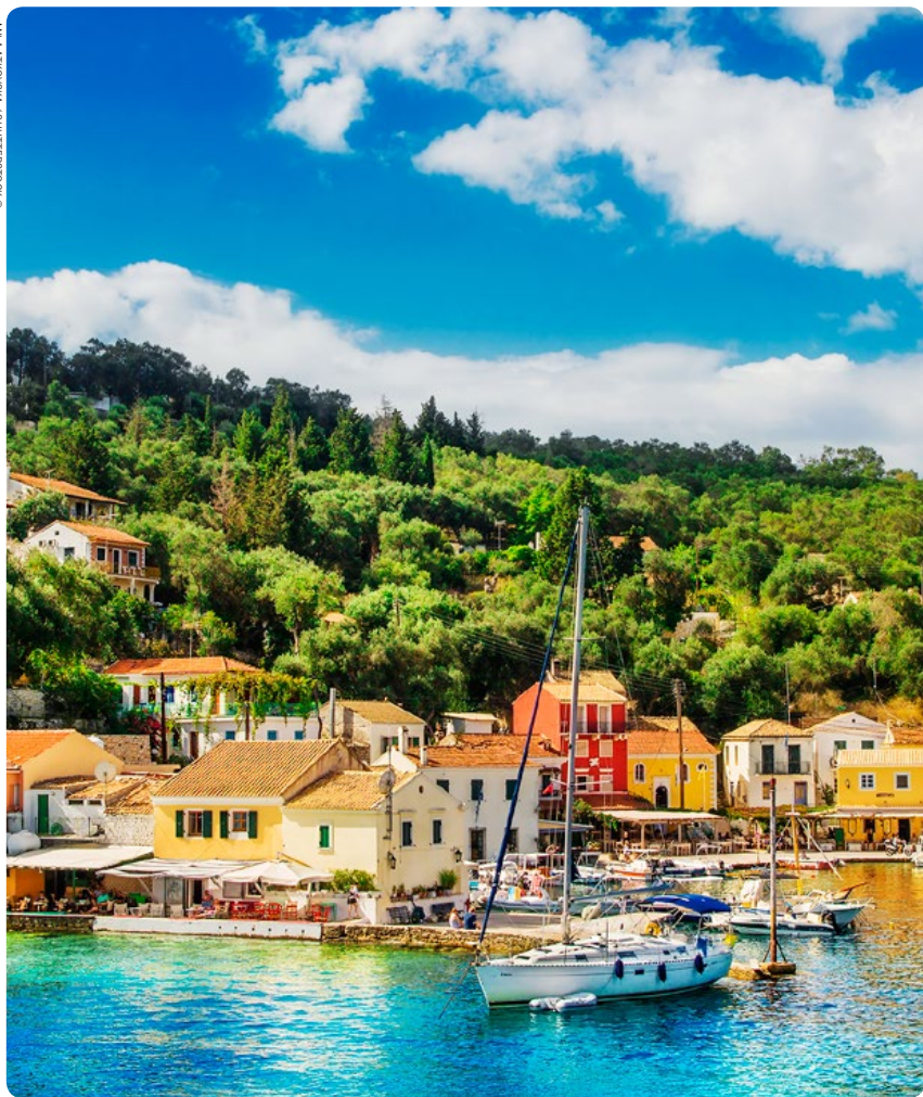
Top: Loggos (p486), Paxi, Ionian Islands Bottom: Agios Georgios (p483), Corfu