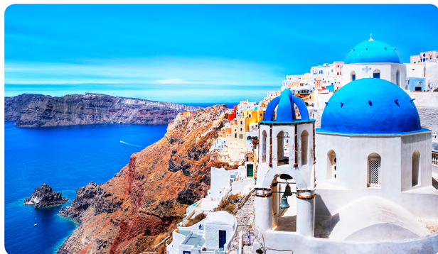
Top: Corfu (p510)