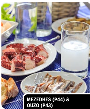
MEZEDHES (P44) & OUZO (P43)