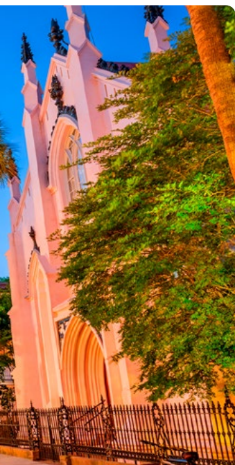
ST PHILIP'S CHURCH, CHARLESTON P171