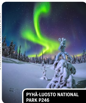
PYHÄ-LUOSTO NATIONAL PARK P246