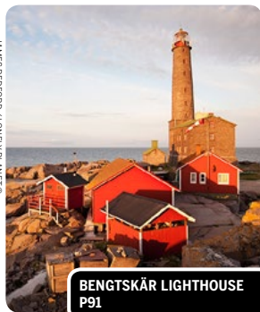
BENGTSKÄR LIGHTHOUSE P91