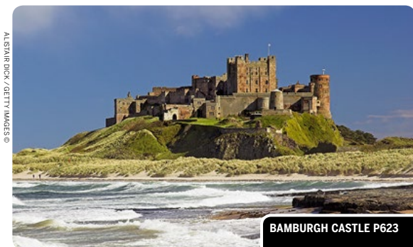
BAMBURGH CASTLE P623