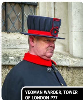
YEOMAN WARDER, TOWER OF LONDON P77