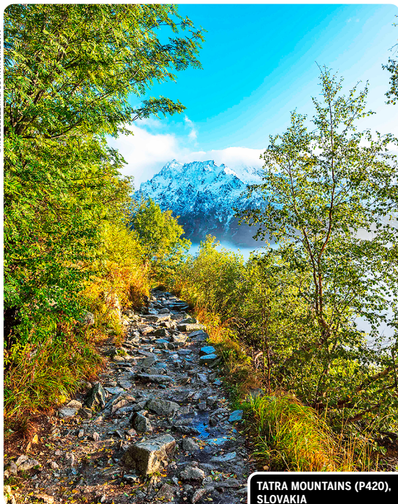
TATRA MOUNTAINS (P420), SLOVAKIA