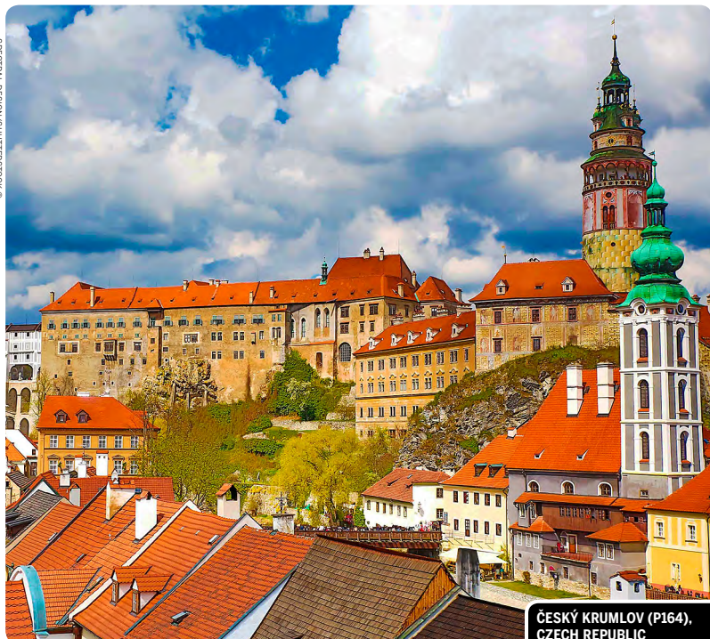
ČESKÝ KRUMLOV (P164), CZECH REPUBLIC