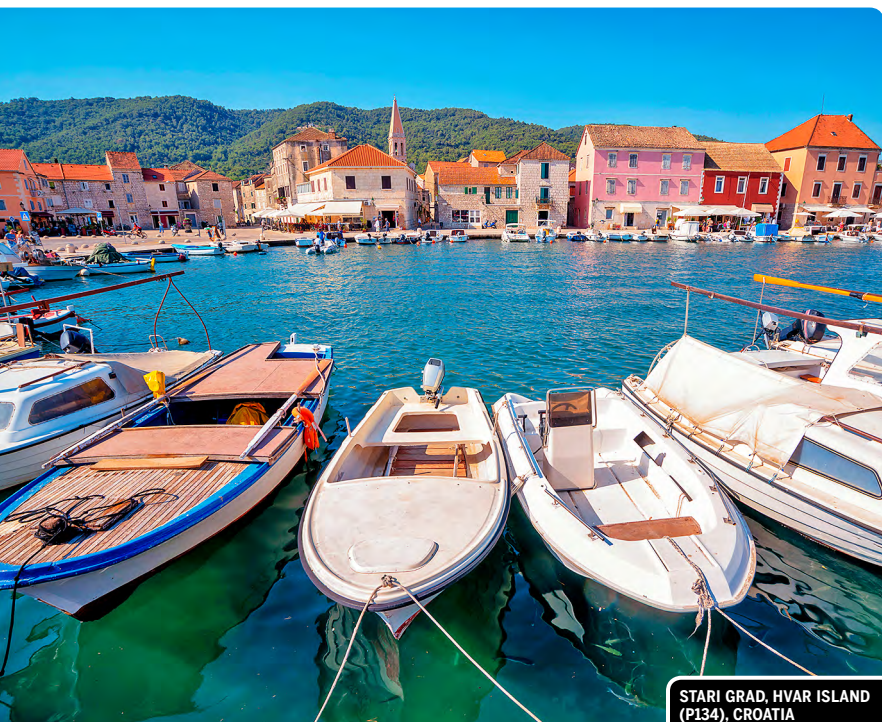
STARI GRAD, HVAR ISLAND (P134), CROATIA