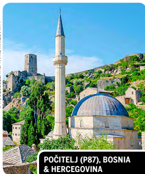
POČITELJ (P87), BOSNIA & HERCEGOVINA