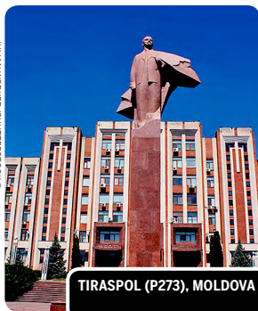
TIRASPOL (P273), MOLDOVA