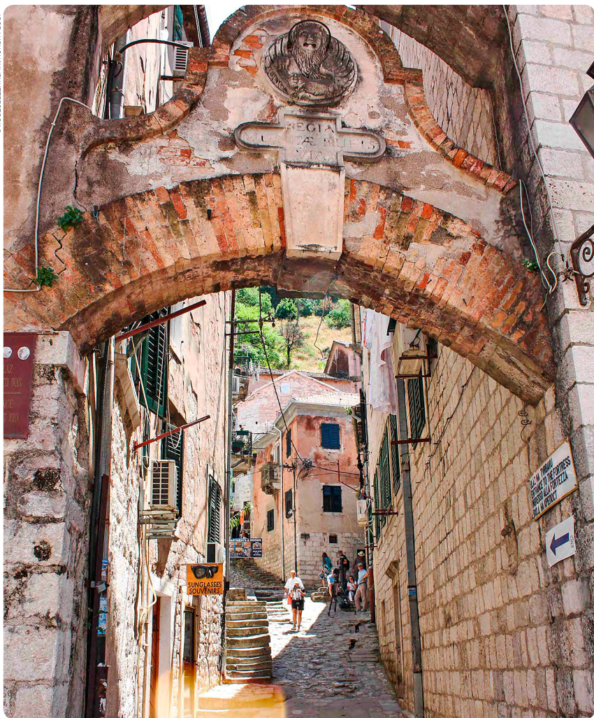
Top: Kotor's Old Town (p279), Montenegro Bottom: Cathedral of St Sophia in Veliky Novgorod, Russia