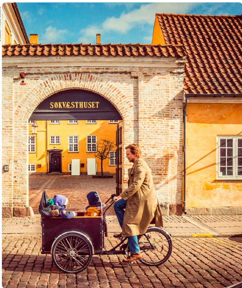
Top: Cycling around Copenhagen (p42)