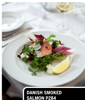
DANISH SMOKED SALMON P284