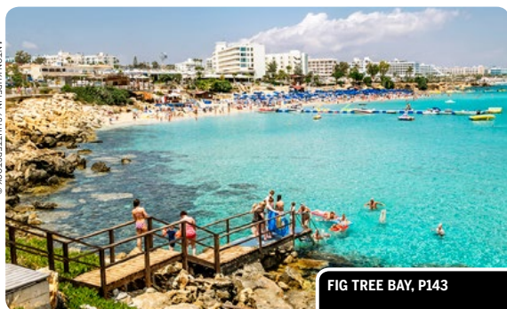
FIG TREE BAY, P143