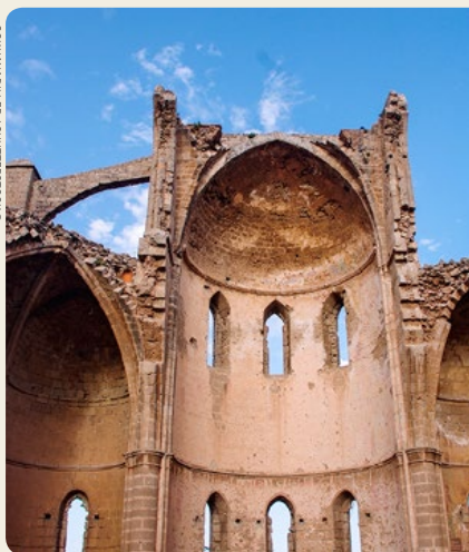
Top: Kyrenia Harbour (p188)