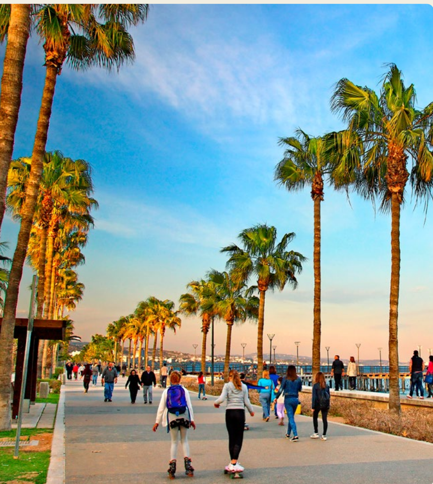
Beach promenade, Lemesos (Limassol; p56)

Then veer west, getting your best goddess-of-love strut on beside Aphrodite's rock at Petra tou Romiou, as you hop to Pafos . Check out the swag of mosaics and ruins here before escaping the crowds to flop on the sand at Lara Beach .