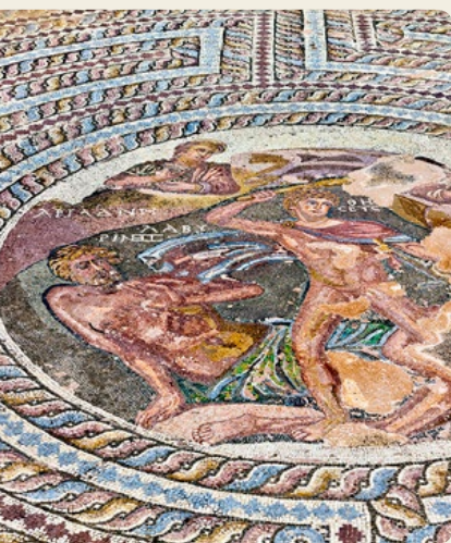
Top: Street scene in Platres (p84) Bottom: Mosaic, Pafos Archaeological Site (p98)