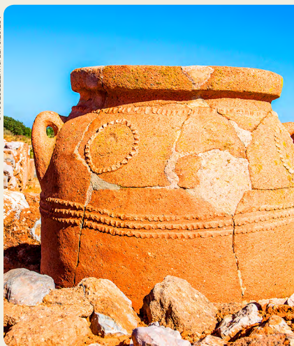
Top: Phaestos (p194)