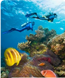
DIVING, GREAT BARRIER REEF P32