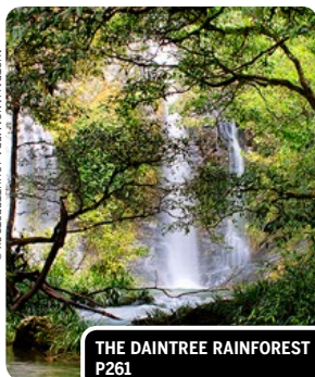
THE DAINTREE RAINFOREST P261