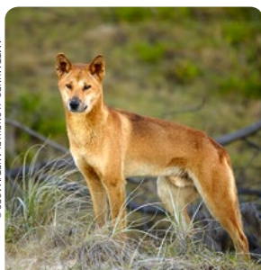
DINGO, FRASER ISLAND P166