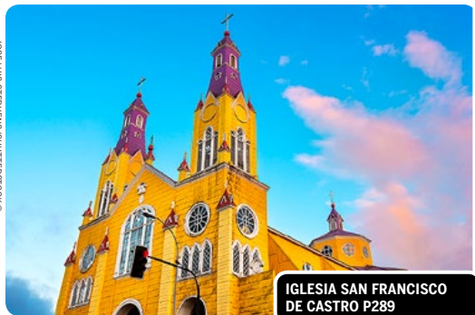
IGLESIA SAN FRANCISCO DE CASTRO P289