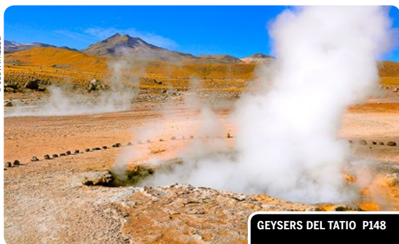
GEYSERS DEL TATIO P148