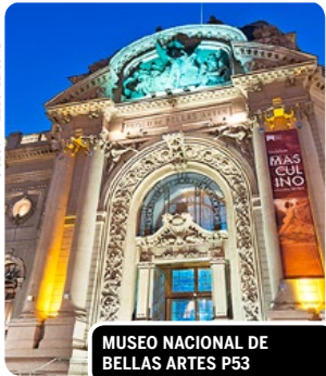
MUSEO NACIONAL DE BELLAS ARTES P53