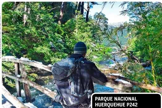
PARQUE NACIONAL HUERQUEHUE P242