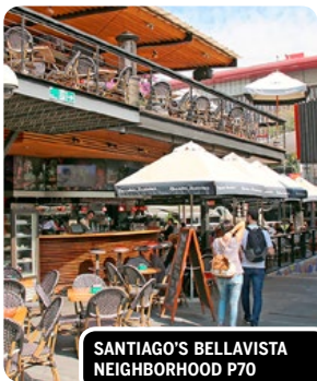
SANTIAGO'S BELLAVISTA NEIGHBORHOOD P70