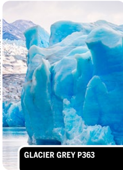
GLACIER GREY P363