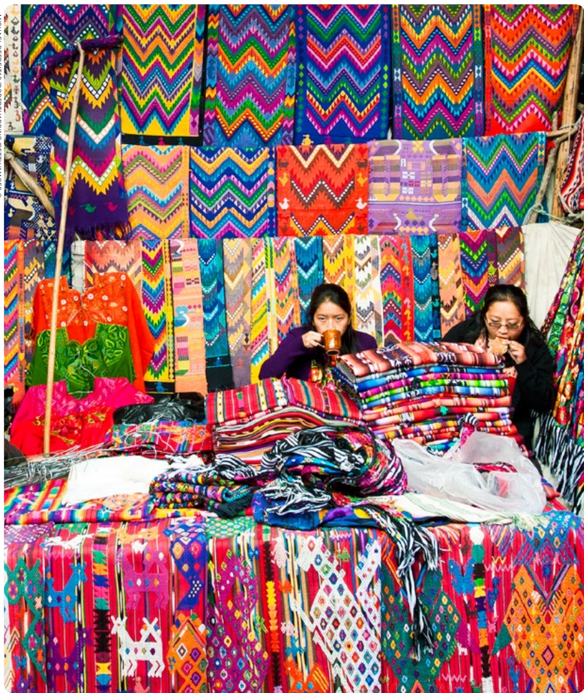
Above: Chichicastenango market (p144), Guatemala