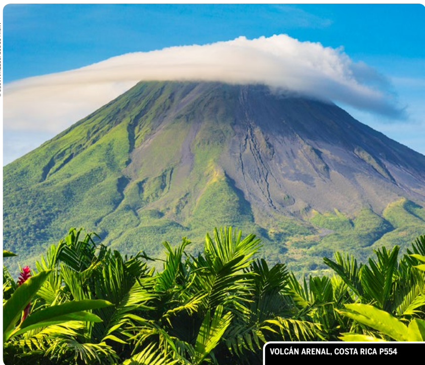
VOLCÁN ARENAL, COSTA RICA P554