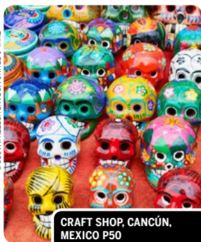
CRAFT SHOP, CANCÚN, MEXICO P50