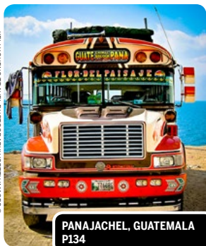
PANAJACHEL, GUATEMALA P134