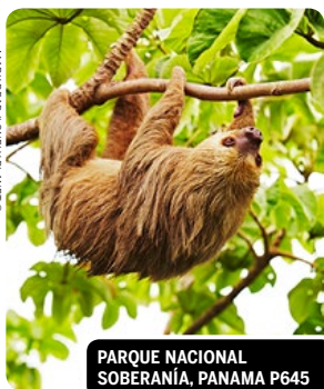
PARQUE NACIONAL SOBERANÍA, PANAMA P645