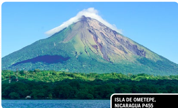
ISLA DE OMETEPE, NICARAGUA P455