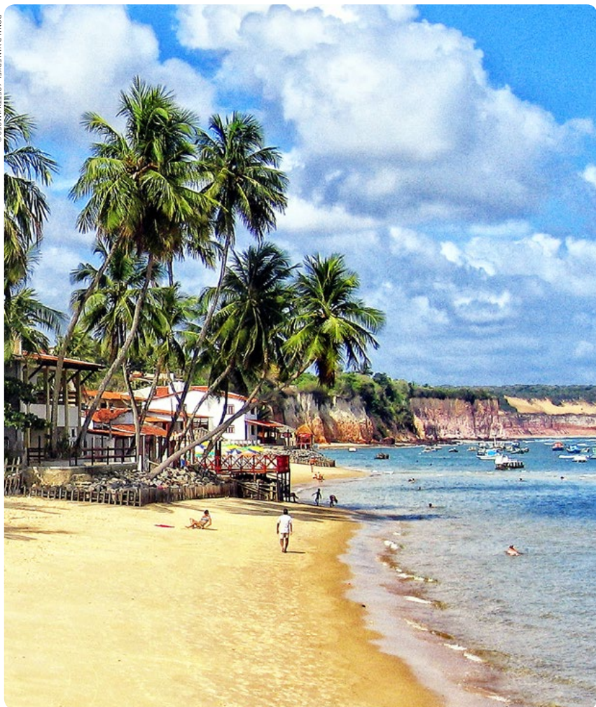
Top: Praia da Pipa (p525)