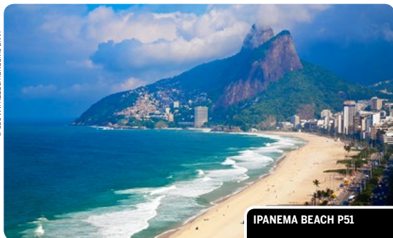
IPANEMA BEACH P51