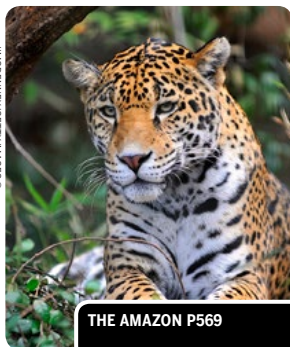
THE AMAZON P569