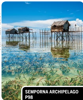
SEMPORNA ARCHIPELAGO P98