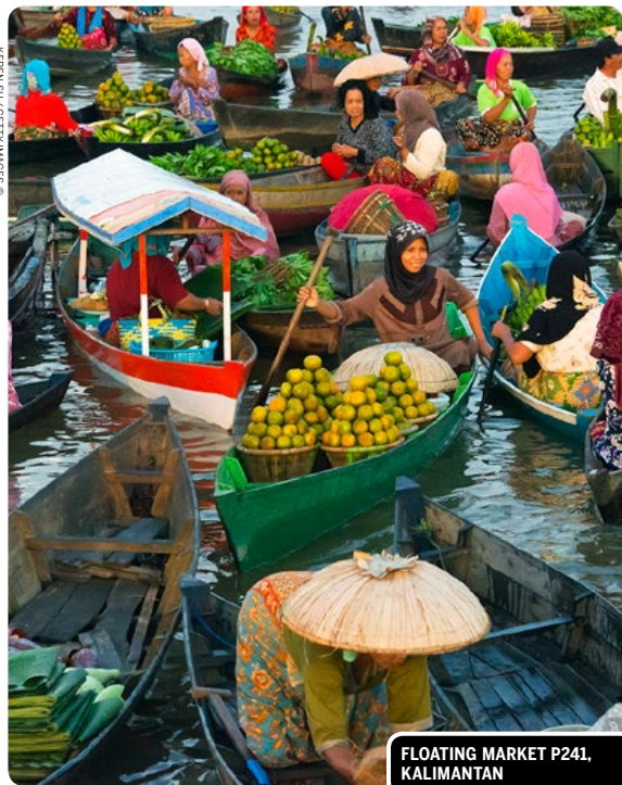
FLOATING MARKET P241, KALIMANTAN