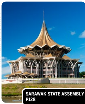
SARAWAK STATE ASSEMBLY P128